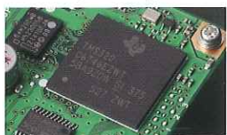
32-bit High Speed Floating Point DSP

The 32 bit high speed floating Point DSP (max 3000 MIPS) provides effective cancellation/reduction (DNR) of the random noise that is frequently frustrating in the HF frequencies. Also: the AUTO NOTCH (DNF) automatically eliminates the dominant beat tone. The CONTOUR, and the APF, are very effective receiver noise reduction tools in the HF bands operations. The YAESU original DSP QRM and noise reduction functions are provided.