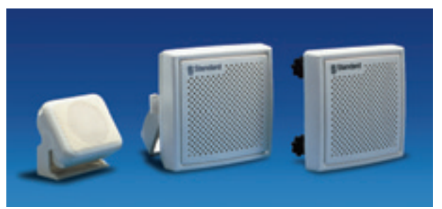
Mini audio extension speaker in black or